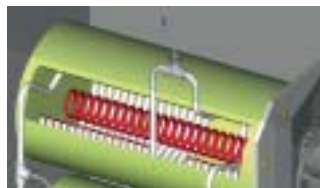
Coiled tube heat exchanger.

The pasteurisers available so far were not particularly suitable for small quantities of top-quality fresh milk. We therefore developed KompaktPasteur which works according to the well-tried functional principle of our heavy-duty heat exchanger used to heat the milk that is fed to calves. This principle is proper for fully automatic pasteurisation of small milk quantities, thus flexibly meeting different requi-