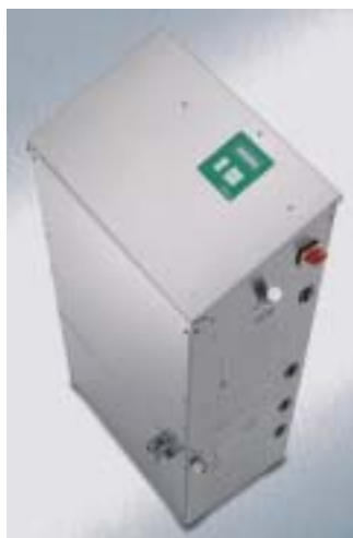
The easy way of pasteurising.

Brand-new to our product range: the KompaktPasteur from Förster-Technik. Making more of milk.