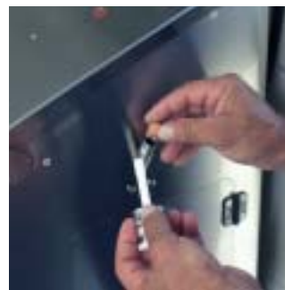
State-of-the art technology for pure milk.

Cleaning is quite easy, too. In order to achieve an optimum circulation cleaning you just have to add a cleansing agent to the cleaning cycle.