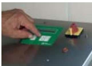
Select and start.

Press the start-button to activate the fully automatic pasteurisation process via an intelligent processor control: heating up the plant, heating the milk, keeping the milk warm, cooling down the milk and