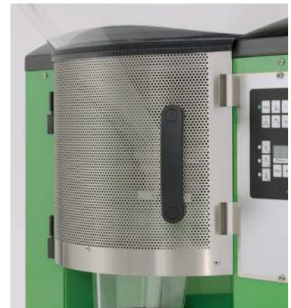
Optional fly protection screen

The fine-pored fly screen for the mixer prevents flies from getting into the feeding box. Steam that arises in the feeding box can easily escape because of the large size of the box and through the pores; condensation water is easily prevented this way.