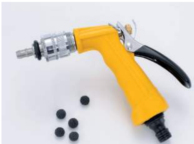
Hose cleaning pistol

The semi-automatic mixer cleaning system is efficient and easy to operate. At the press of a button you have water with a high temperature at your disposal. The open, tiltable feeding box is easily accessible and makes it possible to easily do a function check at any time. You can easily remove deposits in the suction hoses with the help of the hose cleaning pistol and also clean longer hoses with no trouble.