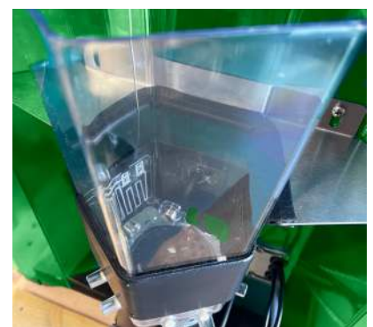
Mixer heating system available as an accessory

The boiler, which has a temperature sensor, an electronic heating regulator and a minimum temperature monitor, ensures that the feed always has the right temperature, and can be easily configured and checked.